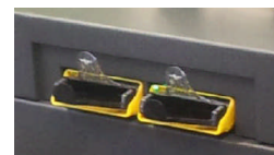
Fig.: BodurCube / BCB — bundled bill deposit system with 2 cash boxes