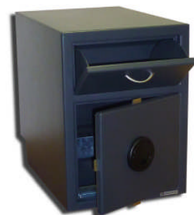
Fig.: BodurCube / side system — optional